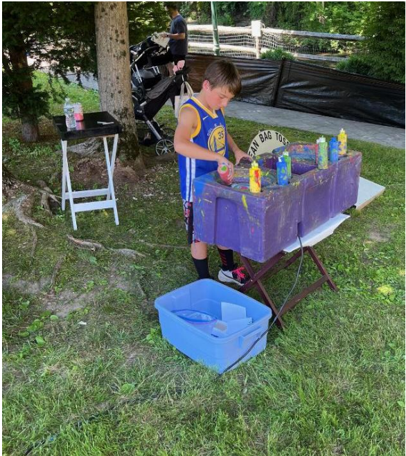
Making Spin Art Paintings