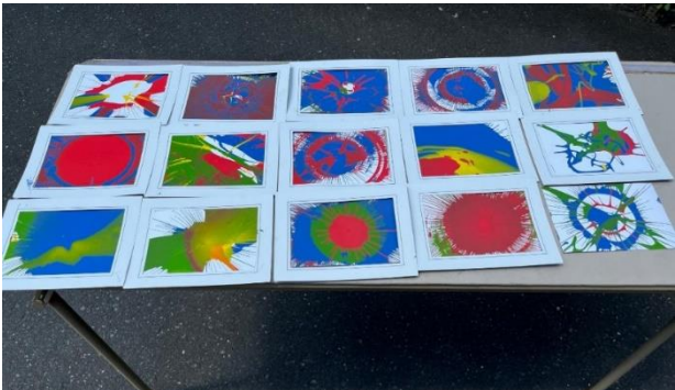
Some kids forgot to take their paintings home.