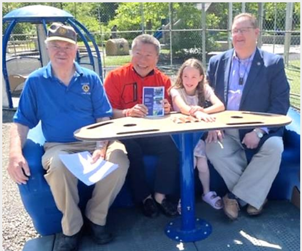
Testing out the new playground equipment with everyone