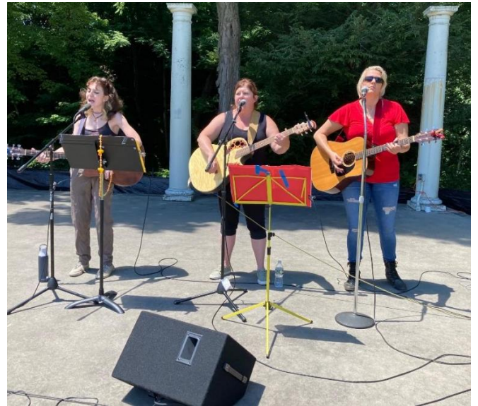
K C Dreams