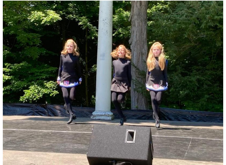
Ashurst Academy of Irish Dance