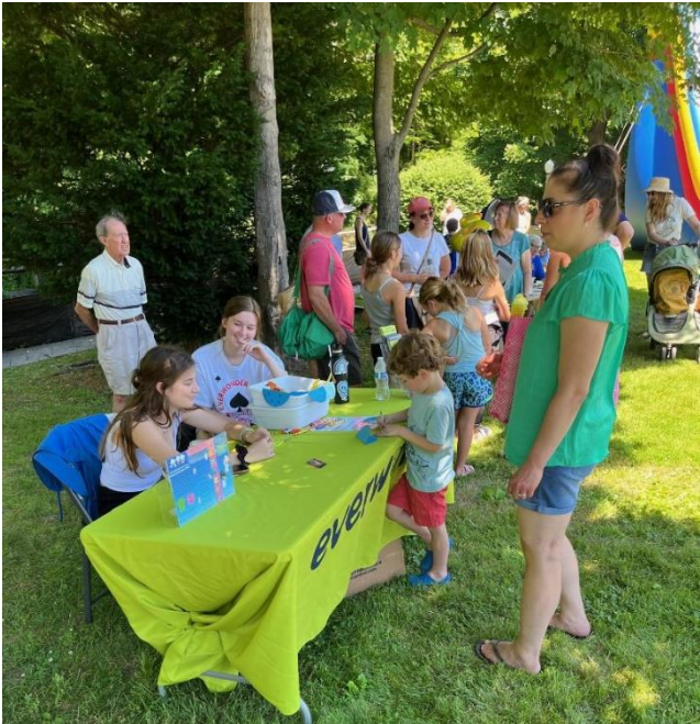
Everwonder Children's Museum