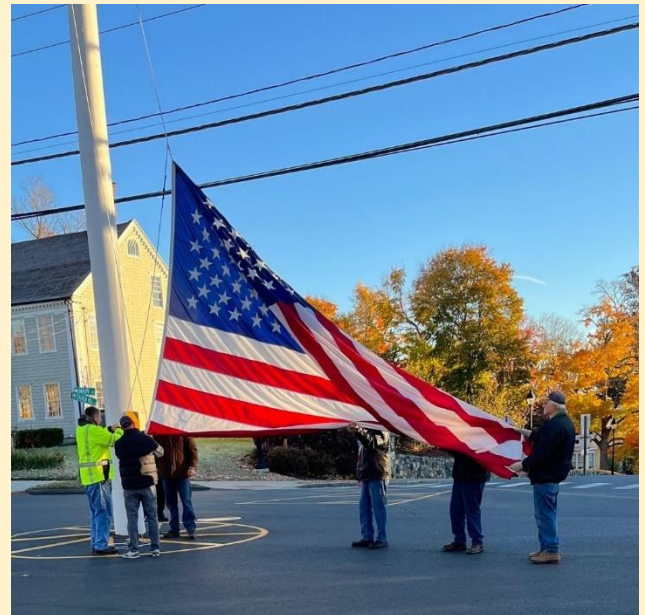
Twice a year the Lions change the flags to meet the weather conditions for the season. The summer flag is larger than the winter flag.