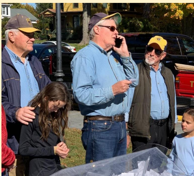
Gary calls the winner to share the good news.