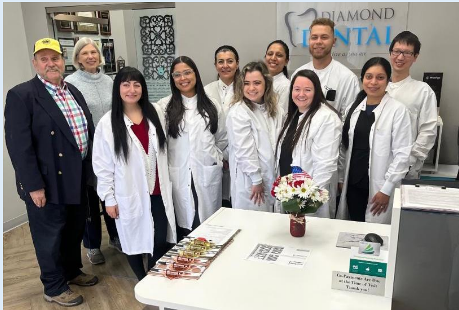
Veterans Day Free Dental Clinic Team