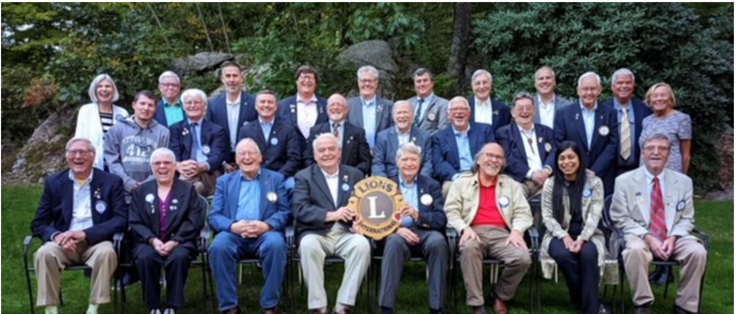
At the September 28 th meeting we all showed up for a photo with Cullen Photographers.