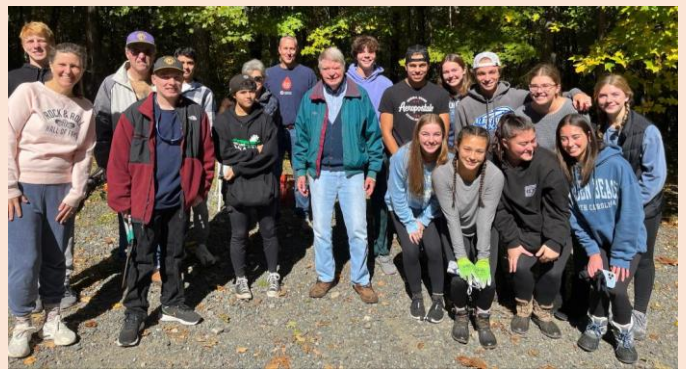
The October Orchard Hill clean-up group. Wow! What a great turnout. Thank you, Leos!