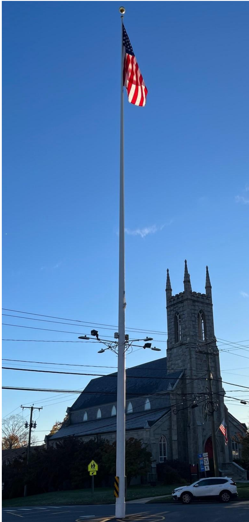
The winter flag waves proudly on the iconic Newtown flagpole in the middle of the intersection of Church Hill Road and Main Street.